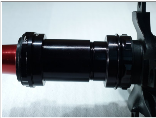
BB SPACER CHART BB30/PF30